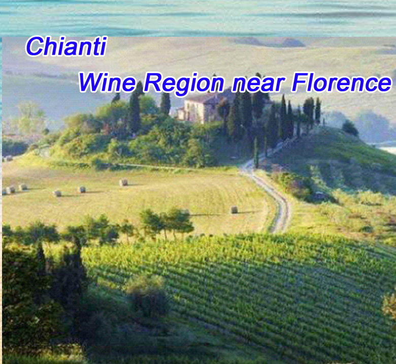
Wine Region near Florence & Siena