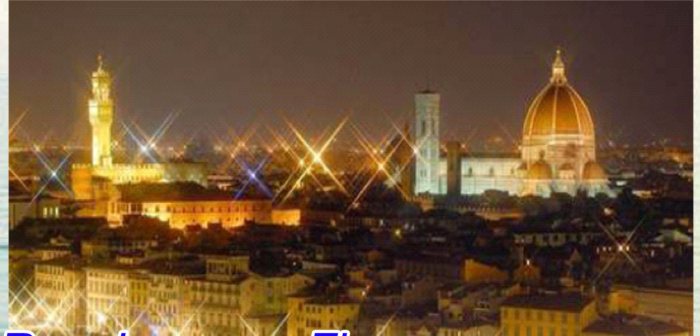
Cradle of the Renaissance - Florence